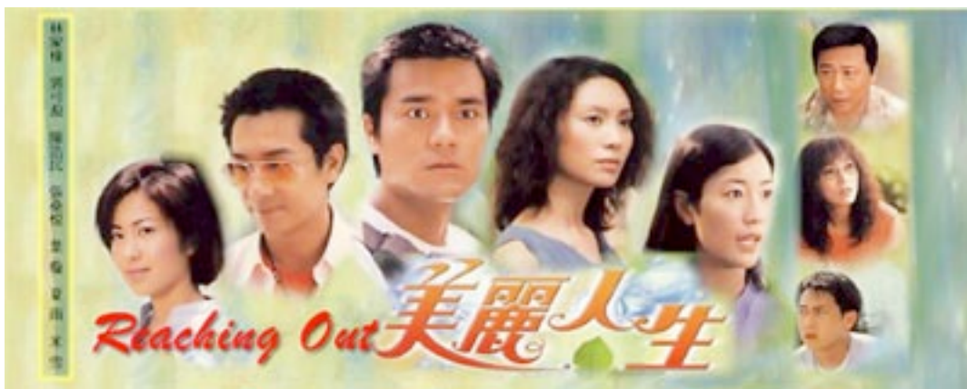
Figure 2: Reaching Out resembles Under the Same Roof and Summer Snow

Japanese heartwarming and sensational dramas about brotherhood, such as Under the Same Roof (Part 1, 93; Part 2, 97, Fuji) and Summer Snow (2000, TBS) were very popular in Hong Kong. Two Hong Kong TV dramas about brotherhood, My Big Elder Brother (97, ATV) and Reaching Out (2001, TVB) were obviously under their influence. No wonder the Hong Kong media refer to these two Hong Kong dramas as the Hong Kong editions of Under the Same Roof . Like the Japanese drama, these two Hong Kong dramas are about the bonds between brothers and sisters in a poor family. For example, like Under the Same Roof and Summer Snow , Reaching Out is a touching story about brotherhood in an orphan family in which the elder brother sacrifices a lot in order to take care of his younger brothers and sisters (fig. 2). The ending of Reaching Out also resembles Summer Snow . In Summer Snow , the protagonist donates his heart to his loved one, whereas in Reaching Out , the elder brother donates his kidney to his younger sister. The similarities in these melodramas indicate that Japan and Hong Kong share similar Asian value regarding family and brotherhood.