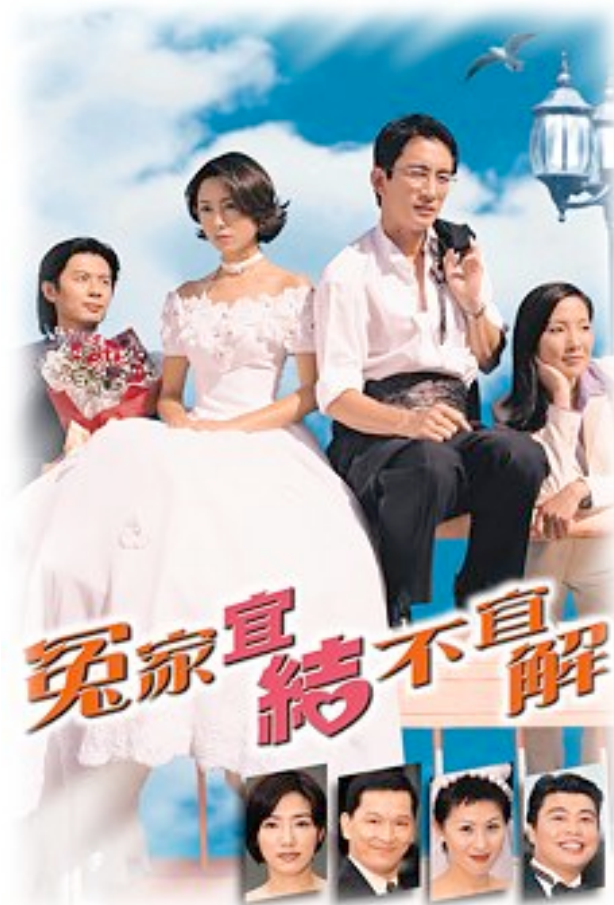
Figure 1: Till When Do Us Apart , the Hong Kong edition of Narita Divorce

Till When Do Us Apart (98, TVB), the Hong Kong edition of Narita Divorce (97, Fuji), is used as an example for content analysis and comparison to demonstrate how influential Japanese dramas had been on Hong Kong dramas in the late 1990s and how these Japanese elements were fused with Hong Kong drama tradition. (fig.1).