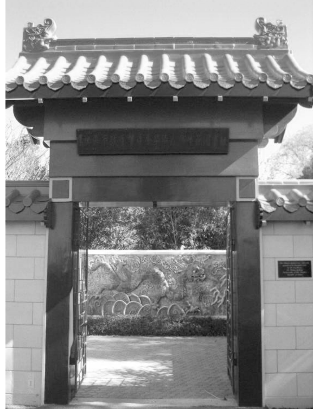
Figure 1. Entrance gate to Oamaru Chinese Garden.