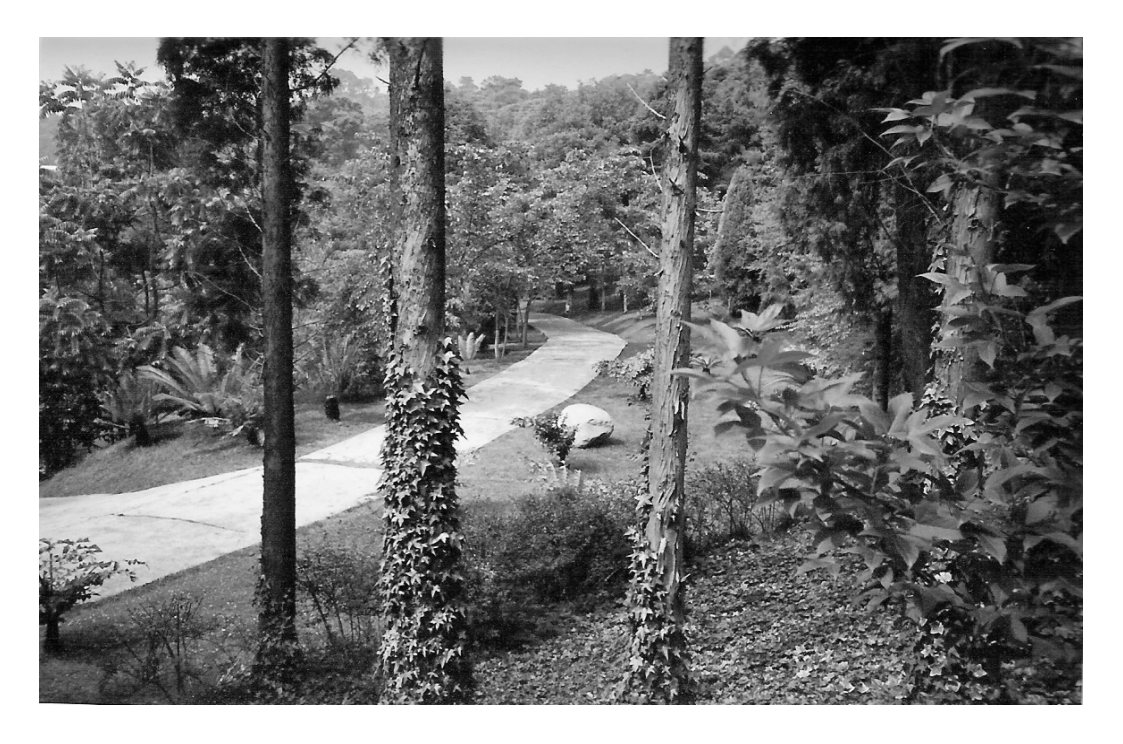
Figure 4. Another view of the site of the New Zealand Garden, rare plants section, Golden Temple Park, Kunming, May 2006.